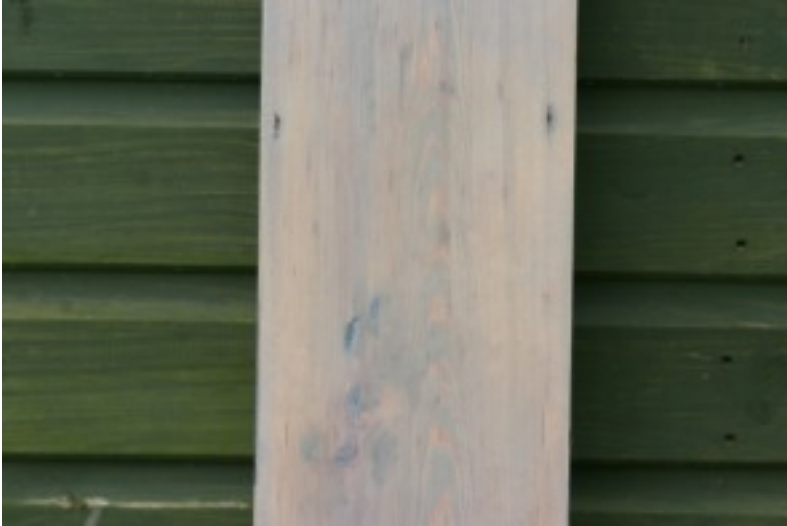
Treatex Hardwax Oil pebble grey

From their new range of colours I have chosen not fifty shades of grey I'm afraid but two, pebble grey and a slate grey. Grey is the new big thing in floors so if fancy a different approach to colouring your old pine floor, or indeed your new hardwood floor just ask to see it and make up your own mind.